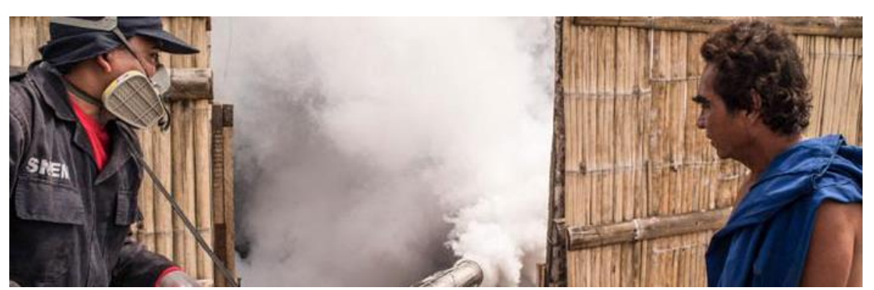
Workers in Ecuador spray insecticide to kill Aedes aegypti mosquitoes, which spread dengue, chikungunya and Zika diseases.

As temperatures rise with climate change, mosquito season extends past the summer months in many parts of the world. Stanford researchers modelled how rising temperatures might influence mosquito behaviour and disease risk around the world. The researchers also calibrated their model with field data on human infections of mosquito-borne diseases. Read more.