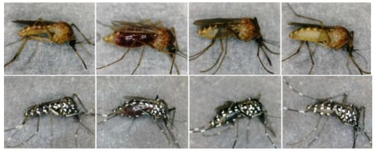
The upper and lower images respectively show Culex pipiens pallens and Aedes albopictus at different stages of digesting human blood meal.

Nagoya University research team shows that human blood extracted from mosquitoes remains viable for DNA analysis up to two days after feeding. This technique can help police work out who was at a crime scene and in the future, might provide evidence that can used to convict offenders. Read more.